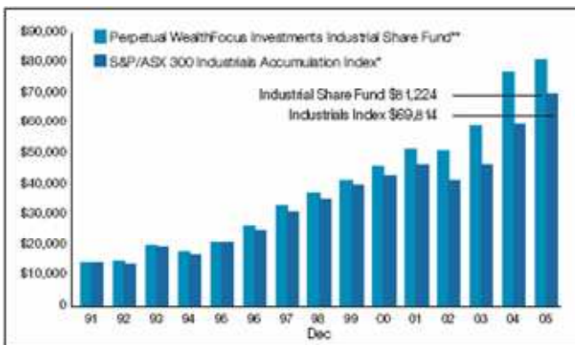
Chart 1: How fund managers add value Value of $10,000 invested over 15 years

Perhaps most importantly, managed investments offer the potential for strong long-term performance. Chart 1 shows how fund managers can add value. It compares the value over time of $10,000 invested in December 1990 in Perpetual's Industrial Share Fund, with $10,000 invested in the S&P/ASX 300 Industrials Accumulation Index. Perpetual's Industrial Share Fund** has outperformed the Index and over fifteen years it is worth over 16% more than the Index ($81,224 versus $69,814).